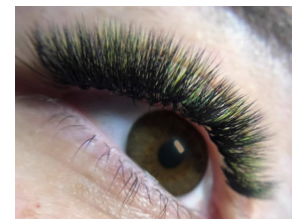
Volume w Color