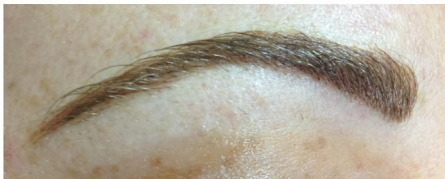
Traditional permanent brows, actual Terraderma client.

Microblading is a semi-permanent solution to thin brows. Microblading is a procedure where organic colored pigment is implanted under your skin with a manual handheld tool instead of a traditional permanent cosmetics machine. Each hairline stroke of pigment implanted in the dermal layer mimics the look of real brow hairs. The effects of the procedure last up to 12 months.