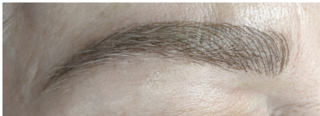
Microbladed brows, actual Terraderma client.